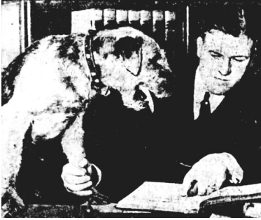
Dormie being paw printed before the trial