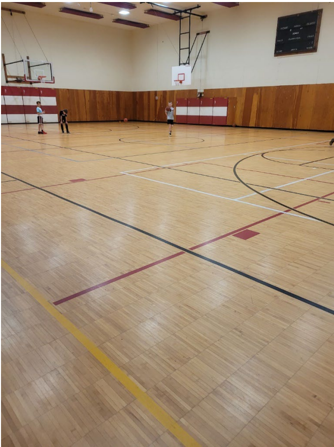
Existing Floor Game Lines