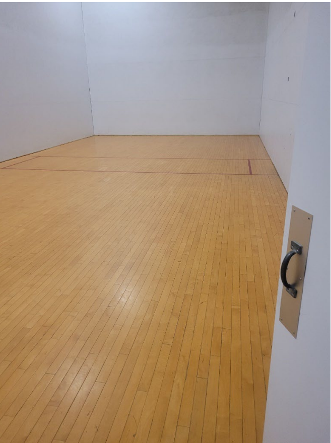
Racketball Floor Room #2