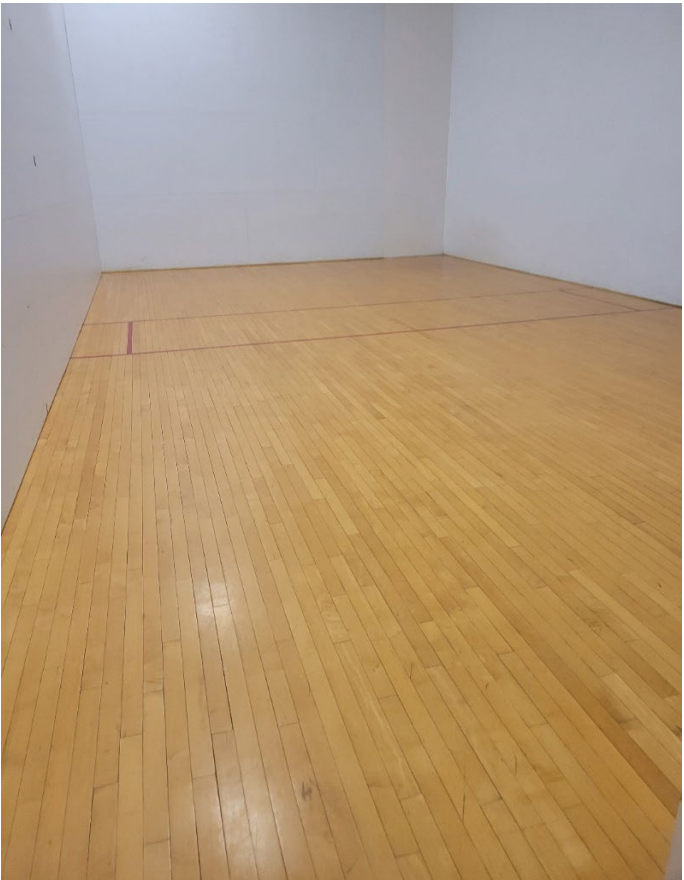
RacketBall Floor Room #1