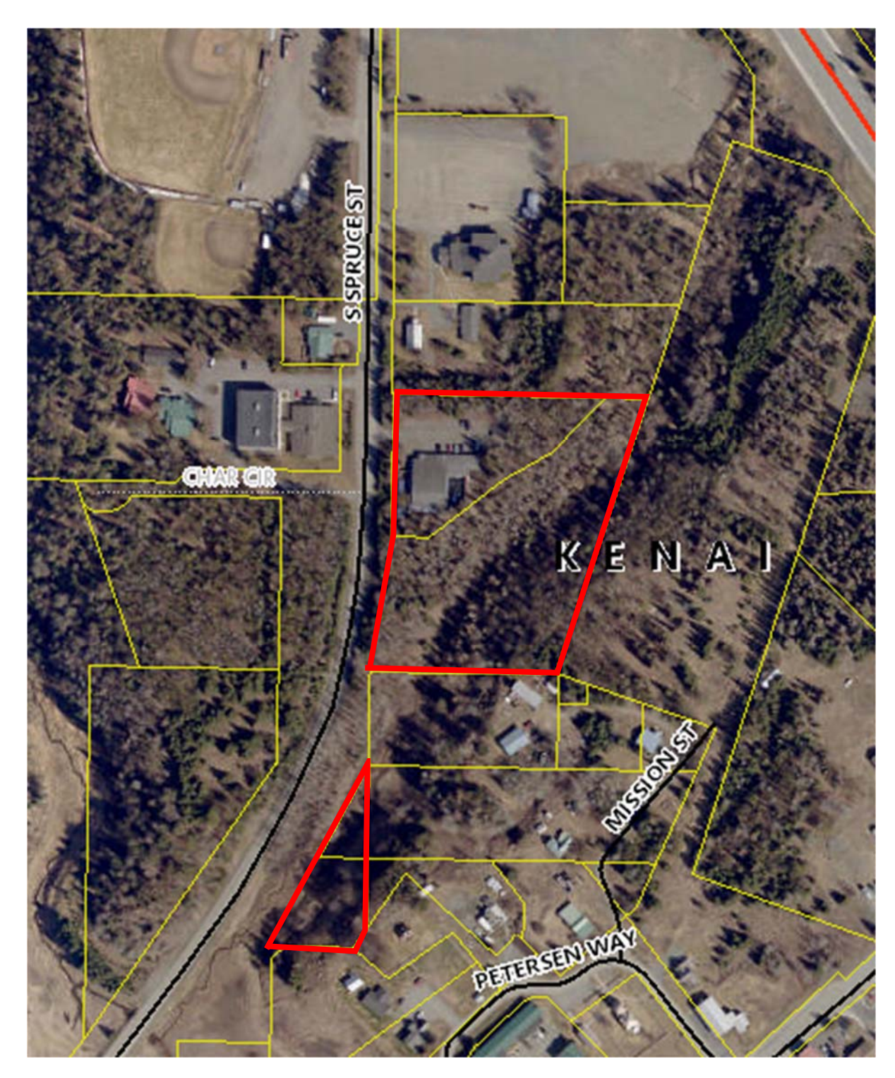
Phase 2 – Map A