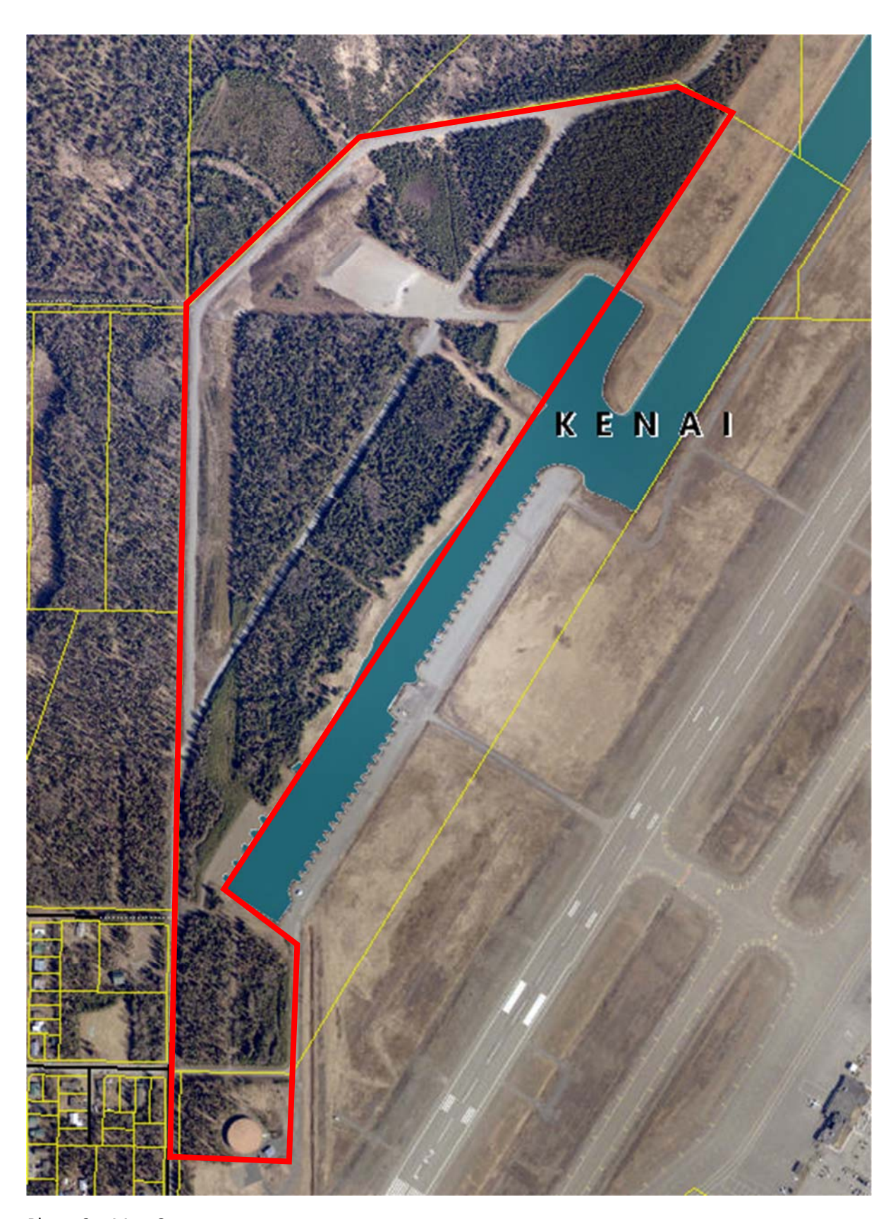
Phase 2 – Map C