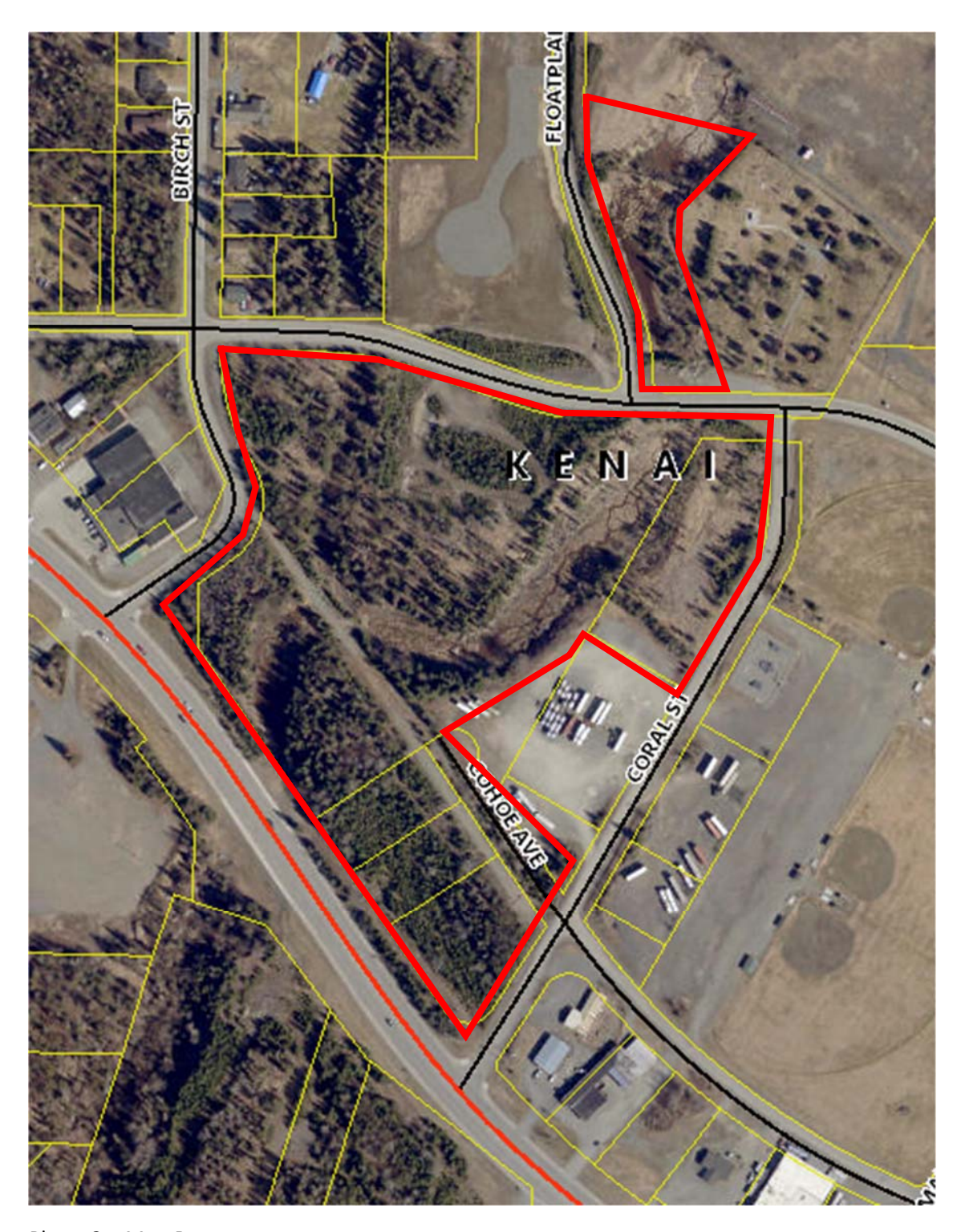
Phase 2 – Map B