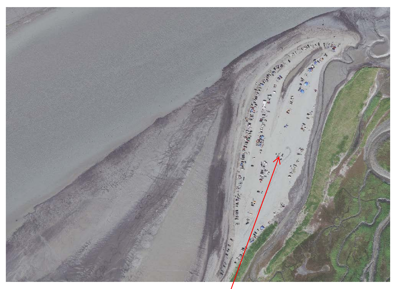
Toilet & Dumpster Locations here, coordinate with City staff