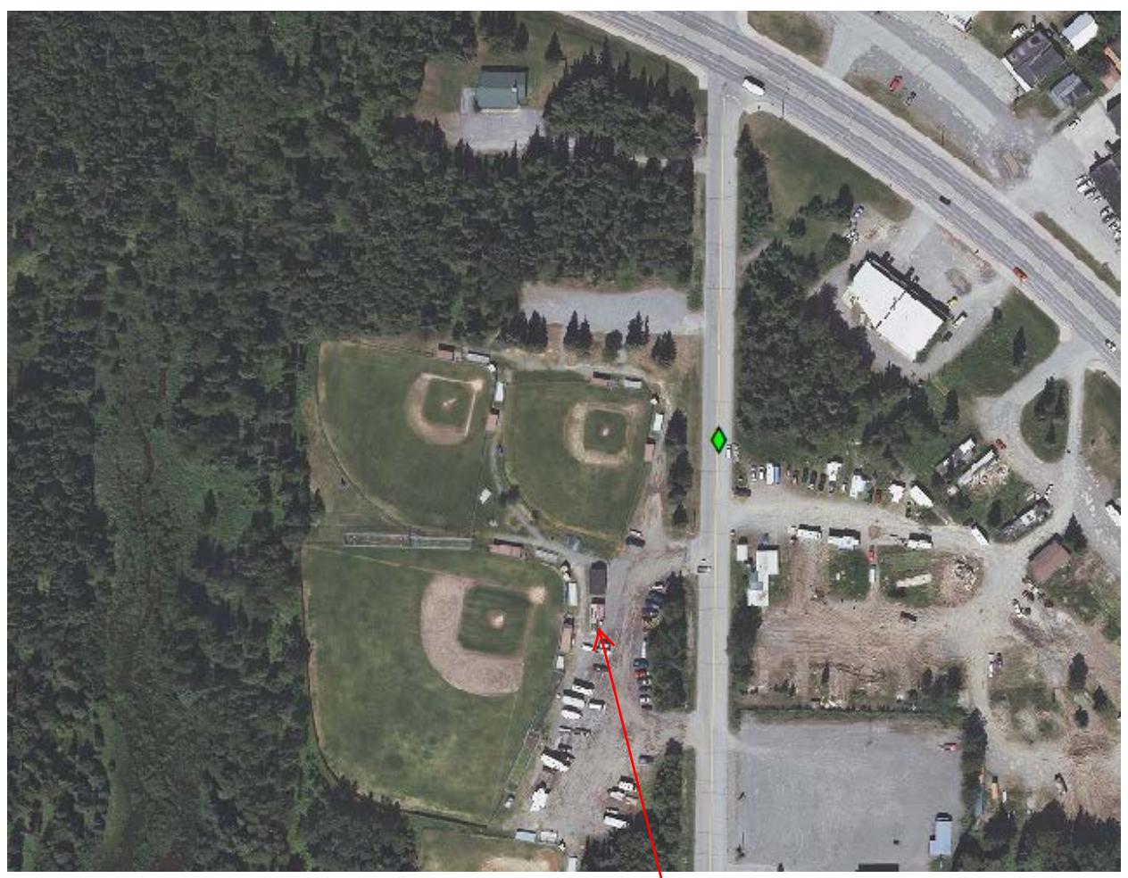
Toilet & Dumpster Locations here, coordinate with City staff