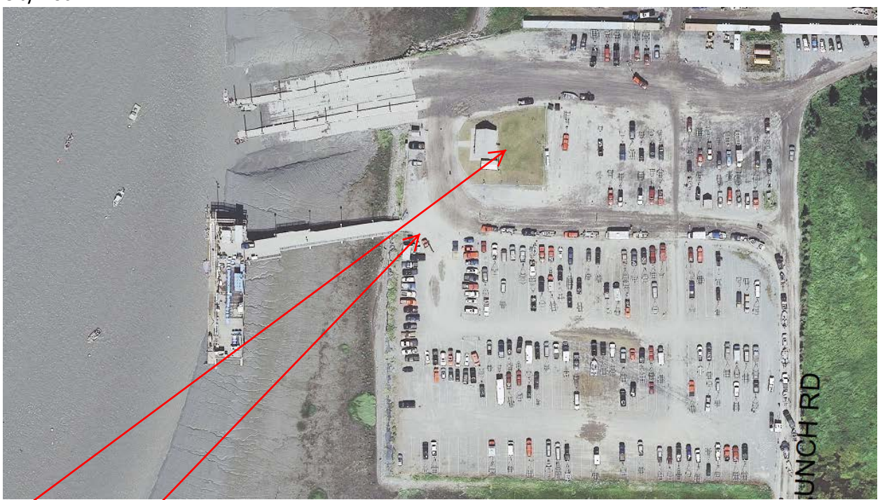
Toilet & Dumpster Locations here, coordinate with City staff