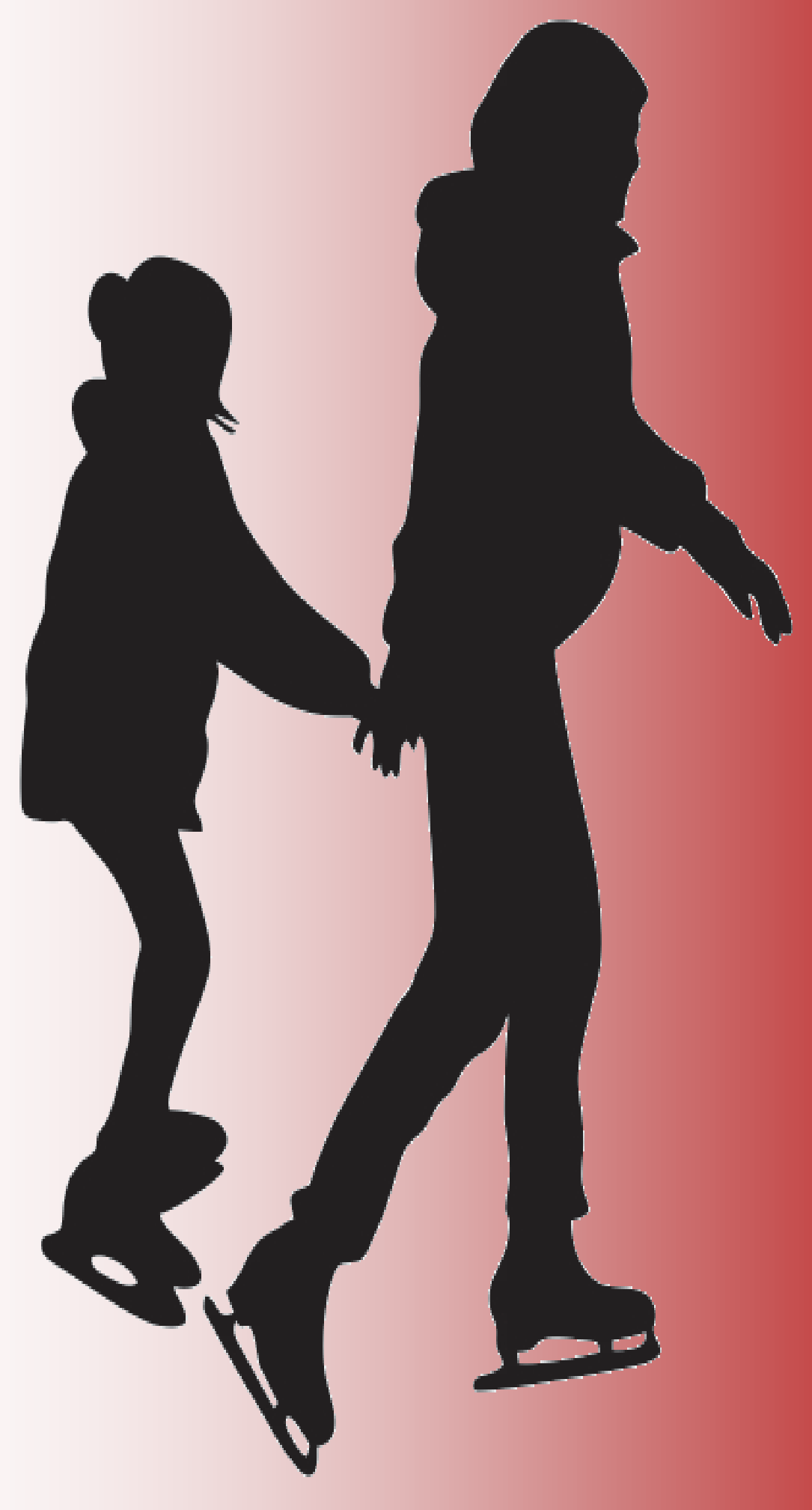
Page 10 of 16