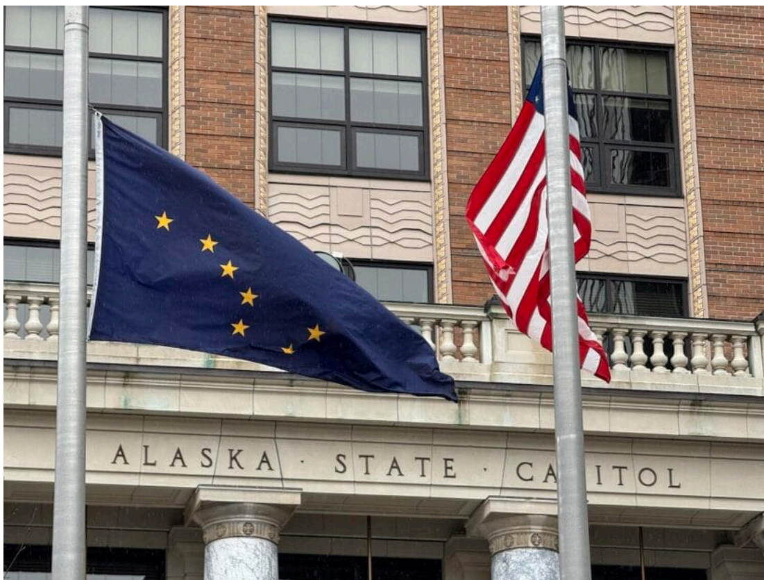
The Alaska and American flags fly in front of the Alaska State Capitol on Tuesday, April 22, 2025.

The Alaska Legislature has approved state funding for child advocacy centers, which support child victims of physical and sexual abuse.